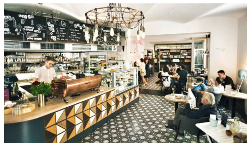
(d) 3rd recommendation