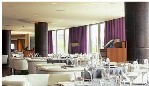
(a) Given Image