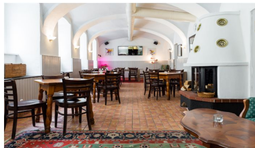
(b) 1st recommendation